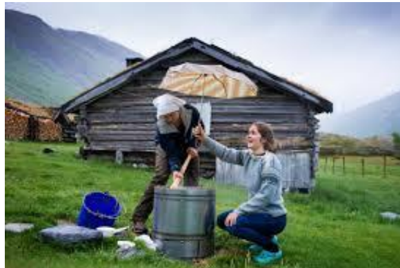
Mountain diary farming