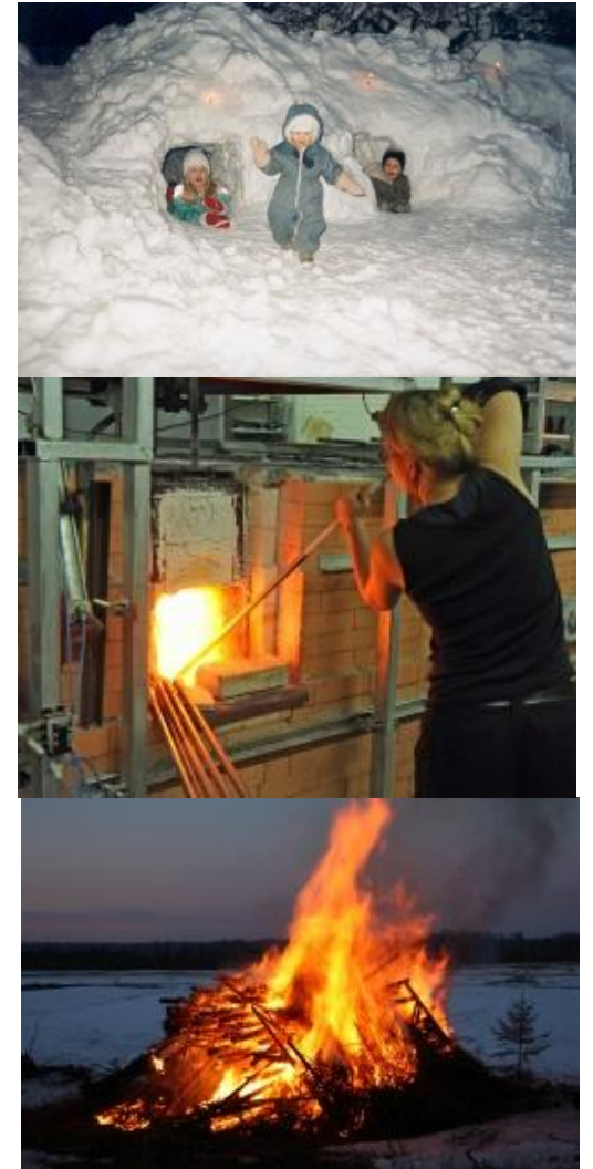
Playing in the snow / Tuusula Museum and Lahti Ski museum; Glassmaking tradition / Glass museum; Eastern Bonfires / The provincial museum of South Ostrobothnia